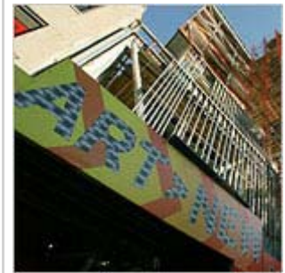
Special Section: Museums