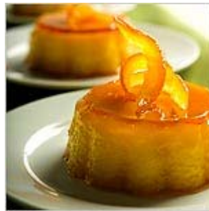
Sephardic Delights Have Flavors of Home and Exile