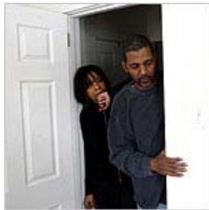
Behind Foreclosures, Ruined Credit and Hopes