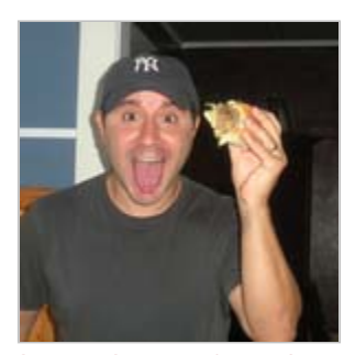
(GUILTY) REFLECTIONS ON EATING