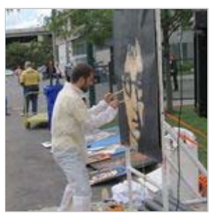
IMAGINE STREET ARTISTS