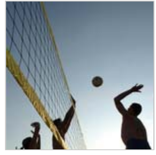
BUFFALO ALTERNATIVE VOLLEYBALL